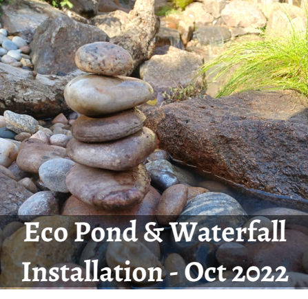
On A Personal Note...

As a lot of you may already know, we got wed in June.